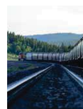
Front cover image: Freight train with hopper cars beneath mountains

Fertilizer Focus Argus Lacon House, 84 Theobald's Road, London, WC1X 8NL, UK Tel: +44 (0)20 7780 4340 Email: fertilizer@argusmedia.com www.argusmedia.com/fertilizer