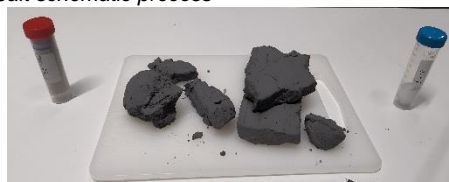
Fig. 2. From left to right: fly ash, "cleaned ash", recovered salts