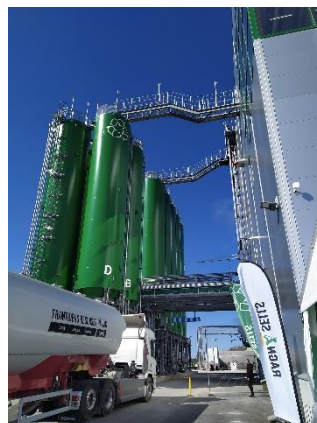
Fig. 3. Silos for ash storing