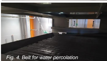
Fig. 4. Belt for water percolation