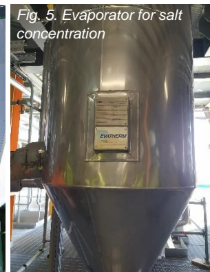
Fig. 5. Evaporator for salt concentration