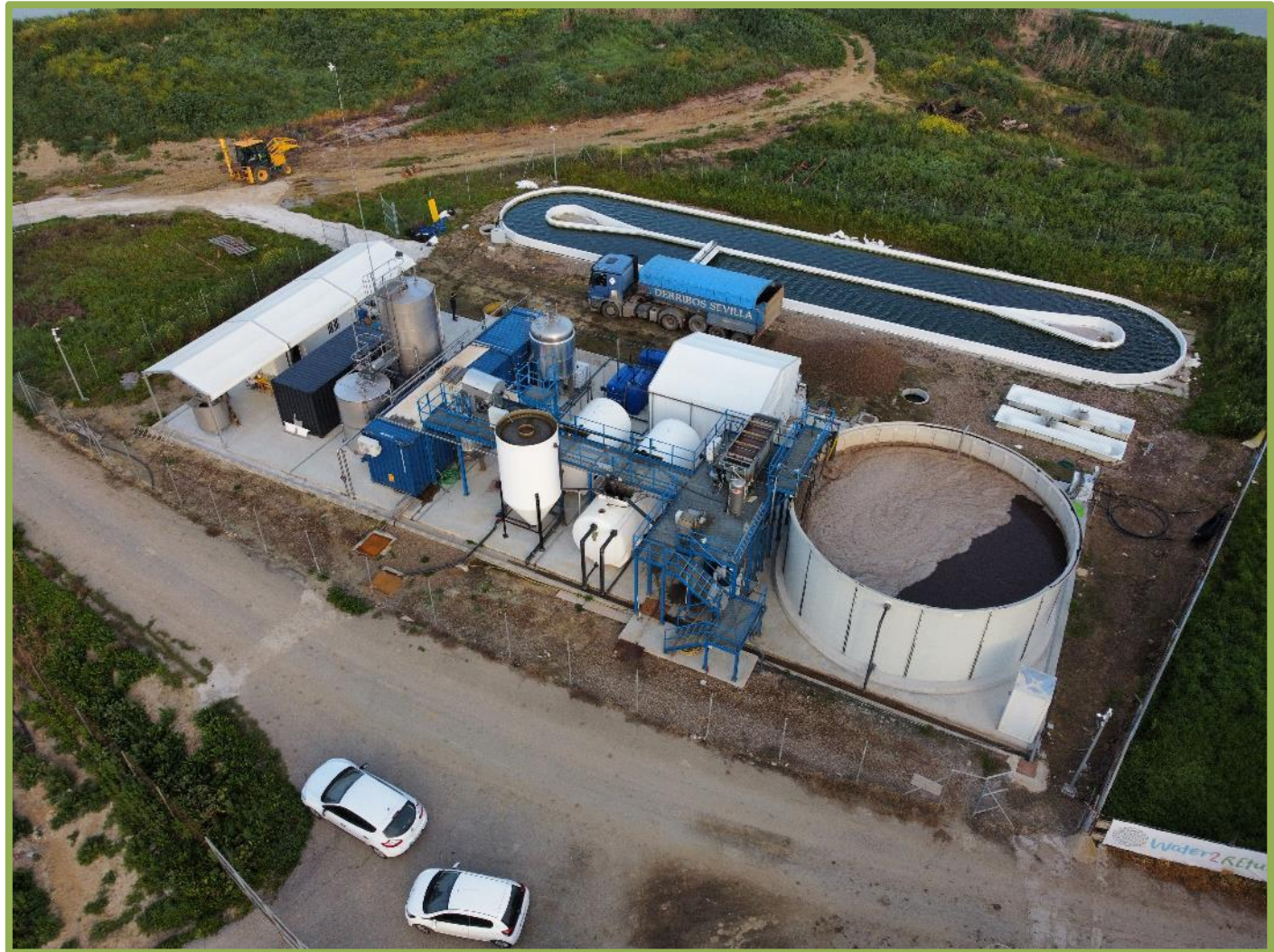
General overview – water line, sludge line, algae line, energy recovery module

Treatment capacity → 50 m 3 per day (out of the 150 m 3 of the slaughterhouse’s daily flow).