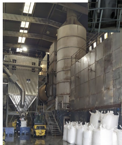
Cooperl site visit: digestate processing, organo-mineral fertiliser production from manure and animal by-products.