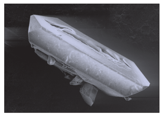
Crystal of struvite preiciptated from sludge liquors (Doyle et al, 2000)

The experimental method utilised a soil which was already rich in phosphorus, and a radioactive labelling method to assess whether plant P uptake was from soil or from an added P-product (recovered Krepro® iron phosphate or commercial watersoluble fertiliser) : radioactive phosphate was added to the soil before the start of the experiment whereas the iron phosphate and fertiliser phosphate used in the experiment were not radioactive. The author suggested that the results indicated that the recovered iron phosphate was 100% available in the soil system and could be considered equivalent to a good commercial (low N) fertiliser. However, it appears that the increase in plant growth and plant P uptake during the experiment were not higher with the recovered iron phosphate product (compared to the no added P control), whereas the commercial fertiliser increased both. The difference between the conclusions drawn from the radioactive P-ratio data and the yield and P-uptake data could be due to various factors including (i) the pot experiment was very short, (ii) the radioactive P-level of the soil (used to calculate the P uptake ratio) was determined soon after addition of the radioactive P to the soil, ie the added P and the labile pool were perhaps not in equilibrium, (iii) the soil used in the pot experiment was high in P so that a benefit from the phosphate products could not be clearly measured.