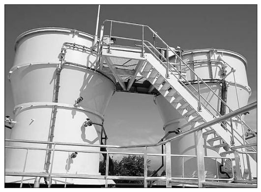
The full-scale calcium phosphate recovery installation at Geestmerambacht sewage works, The Netherlands, was visited by Concerence participants.

The Crystallactor® process is a fluidised bed reactor precipitating calcium phosphates as recyclable pellets by the addition of calcium hydroxide. Full-scale Crystallactor® units have been operated at three sites in The Netherlands (two sewage works, one food industry factory), the first being commissioned in 1988. The Conference participants were able to visit the full-scale Crystallactor® P-recovery installation, commissioned in 1993 and still operational, at the Geestmerambacht sewage works, treating a soluble-P-rich sidestream of the biological Premoval process. This experience was presented by Simon Gaastra, who confirmed results already presented after four years of operation at the first Conference in Warwick (1998)?. This process currently requires the removal of carbonates from the liquors treated in the unit (by taking the pH down to around 6), which renders the process economi-